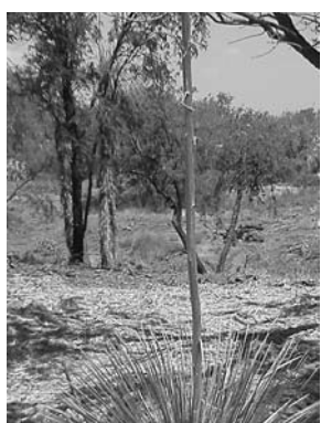
These photos show before and after shots of the area near the entrance to Oracle, just off Highway 77.