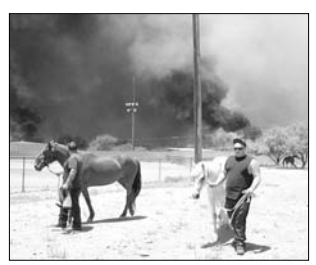
Leading horses out at Kearney Fire 2015

The Horse Evacuation Group is creating an emergency plan, which, along with leaving early, are the keys to success! Get your horses to a safe place and if you can, help your neighbors. Our group is creating lists and phone contact information on ENS so that, in case of a fire, you will be notified. In addition, we are identifying staging areas and